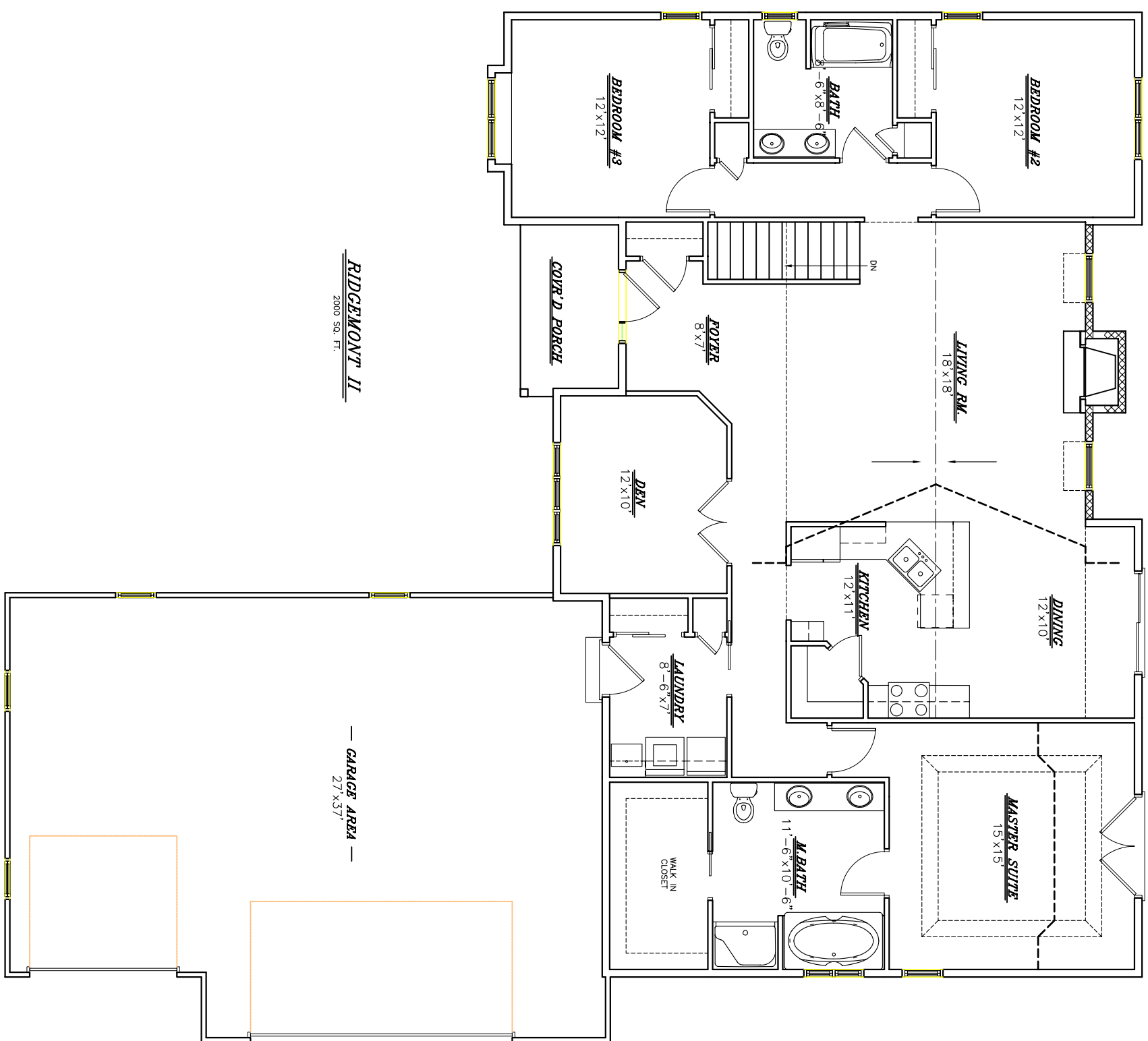
RIDGEMONT II 2000 SQ. FT.